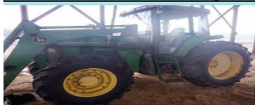
JD 7200 MFWD w/LOADER

Kamloops Stockyards 2 Day Timed Online Sale!