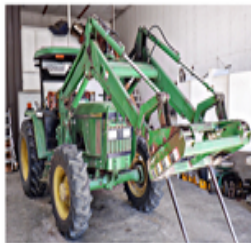
John Deere 6200L c/w 640 Loader - Quick Attach, 83 HP, 4WD, Open Station, 3PTH, 6' Bucket

Equipment can be viewed on March 4th & March 5th From 9AM - 3PM at 4240 Eldon Frontage Rd. Tappen, BC