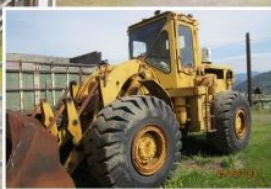
CAT 966C WHEEL LOADER 10,000 HRS