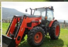
2012 KUBOTA M126 C/W M56 LOADER & BUCKET 4WD, 1395 HOURS

3 KUBOTA TRACTORS | JD 8430 4WD | FORD 4610 TRACTOR | FORDSON TRACTOR | JCB 1550 BACK HOE | CAT 966C WHEEL LOADER | JD 644A WHEEL LOADER | BOBCAT 975 SKID STEER | KUHN 10' POWER HARROW | CASE DC 132 HYDRA SWING ROTARY DISC BINE | NH 7230 DISC BINE | CASE RB564 ROUND BALER | JD 930 DISC BINE | JD 913 3 SHANK SUBSOILER | BOOM SPRAYERS | HAY AND ROCK RAKES | ROCK PICKER | AG-BAGGER JR-700 | BALE WAGON | ROLL OVER PLOWS | JD CHOPPER | DIESEL IRRIGATION WATER PUMP ON TRAILER | IRRIGATION MAINLINE | CRESTON LEFT HAND DISCHARGE MIX/FEED WAGON | 2003 TANDEM LIFT OFF STOCK / FLAT DECK TRAILER | POST OUNDER | BALE SPEARS | HAY WAGONS | HI HOG BALE FEEDERS & MUCH MORE!!