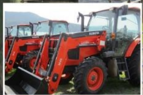
(1 OF 2) 2014 KUBOTA M110 C/W M46 LOADER & BUCKET 4 WD, 239 HOURS & 1190 HOURS