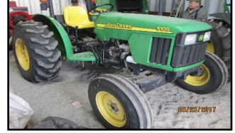
JOHN DEERE 5105

All this Incredible equipment has been kept Under a roof