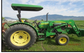
JOHN DEERE MODEL 5425