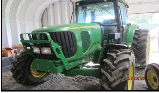
JOHN DEERS MODEL 6615