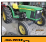
JOHN DEERE 510g