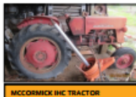
MCCORMICK IHC TRACTOR

All this incredible equipment has been kept under roof