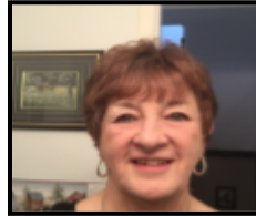
ADA MOGGE A.L.L.C. CAIB