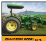
JOHN DEERE MODEL 5425