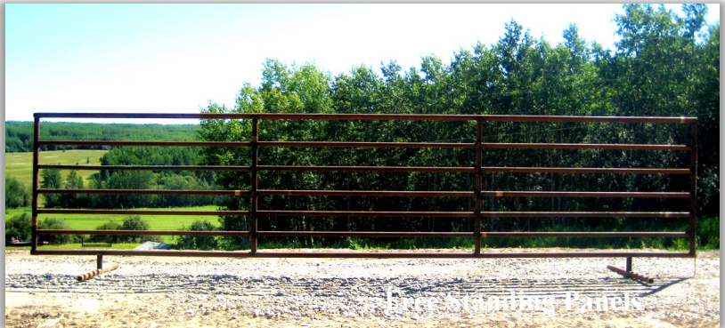
Free Standing Panels

PHONE IN YOUR ORDERS. WE'RE ALWAYS BUILDING LOADS 250-573-3939