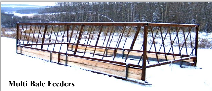
Multi Bale Feeders